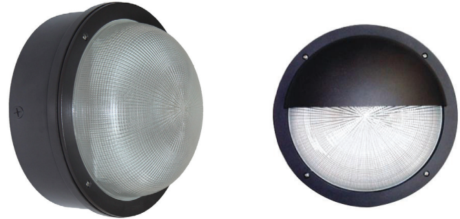
Optional Closed Eyelid